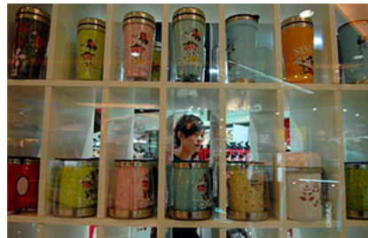
A customer looks at products at the Disney flagship store in Shanghai on Nov. 4, 2009